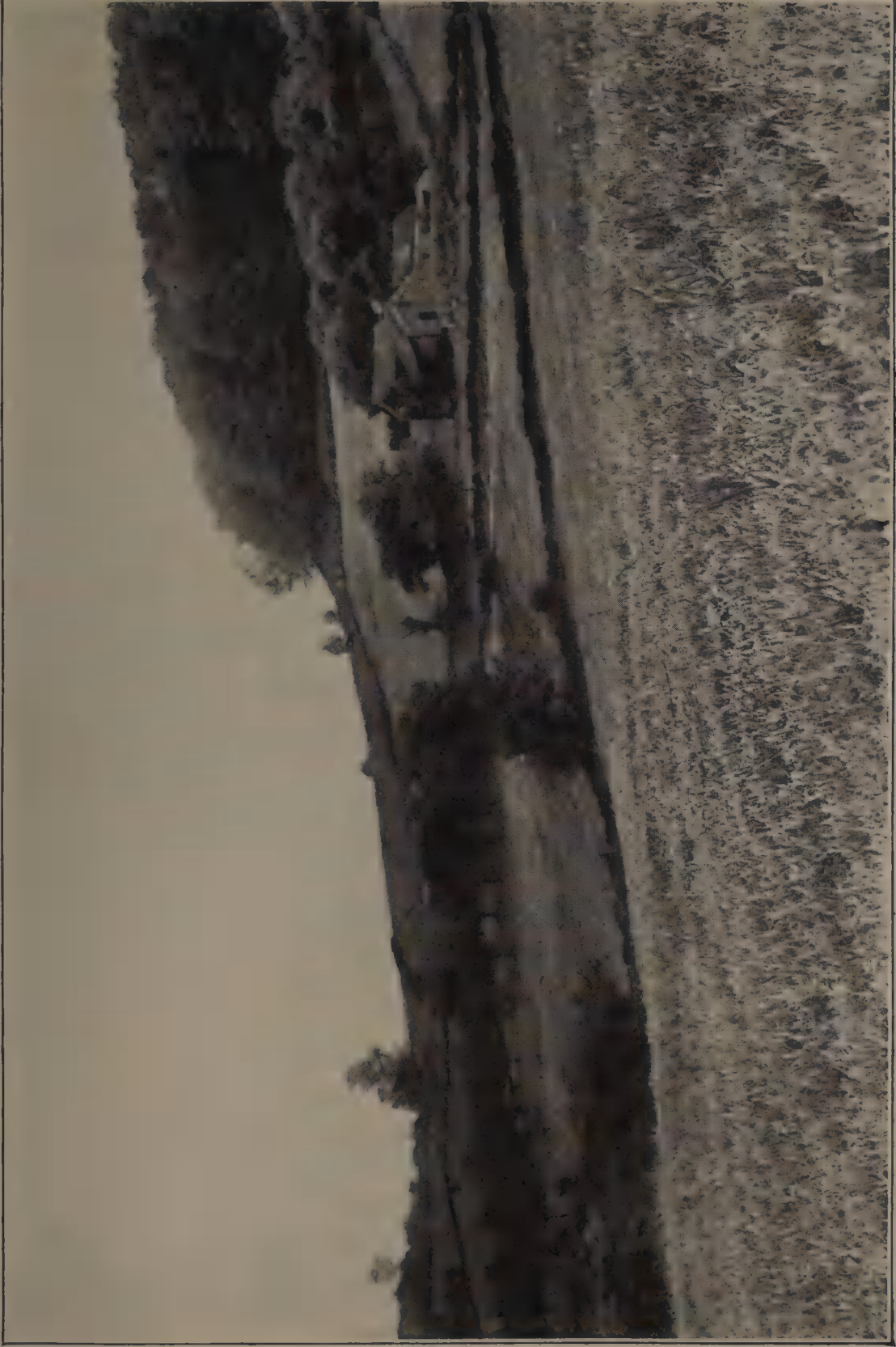
WOODCHUCK LODGE AND BARN